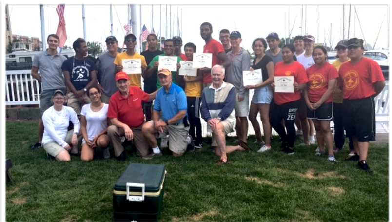
New York Council members, Manhattan Yacht Club members and New York Council Youth Programs participants celebrate after a great day on the water.